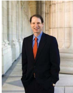
Senator Ron Wyden

that would operate outside of current international institutions such as the World Trade Organization and the World Intellectual Property Organization.