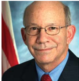
Congressman Peter DeFazio

policy for this country. We cannot continue to hemorrhage our manufacturing jobs and industrial base to countries that don’t compete fairly. These three agreements were written by the Bush administration and are unfortunately endorsed by the Obama administration and they will be a disaster for this country.”